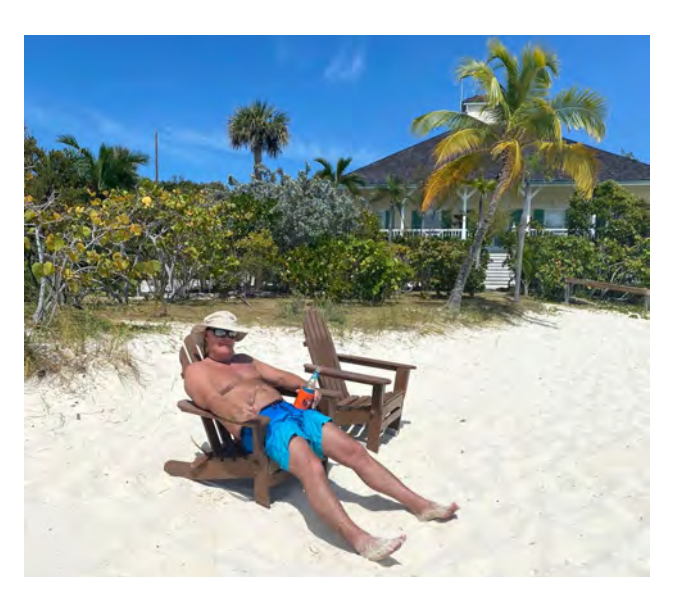
June 2022 www.lake-hartwell.org Page 3