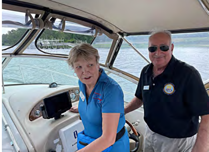
Cruising up to Inlet View for Lunch aboard the Norris' beautiful cruiser