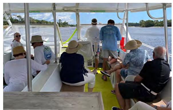
The Sunset cruise had to be canceled due to high winds but we were able to enjoy a nice ride the next day.