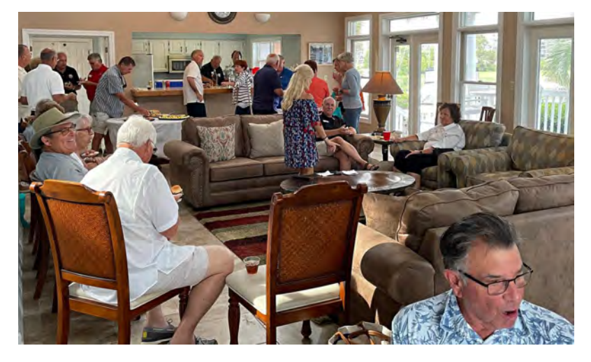
Commander's Reception at the Lightkeeper's Clubhouse.