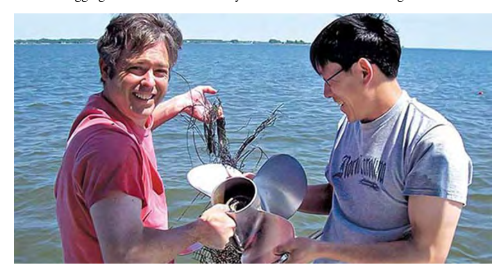
Crab pots can bring you to a stop fast. Be sure to have a rigging knife

If you notice an apparent loss of engine power or temperature climbing, you might have a fouled propeller. Stop quickly and anchor to inspect. Always have a marine rigging knife connected to a lanyard available to cut the fouling loose.