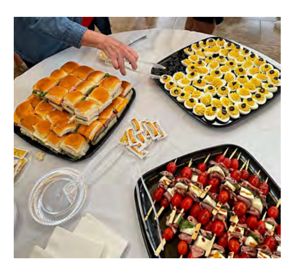
Part of the delightful feast.